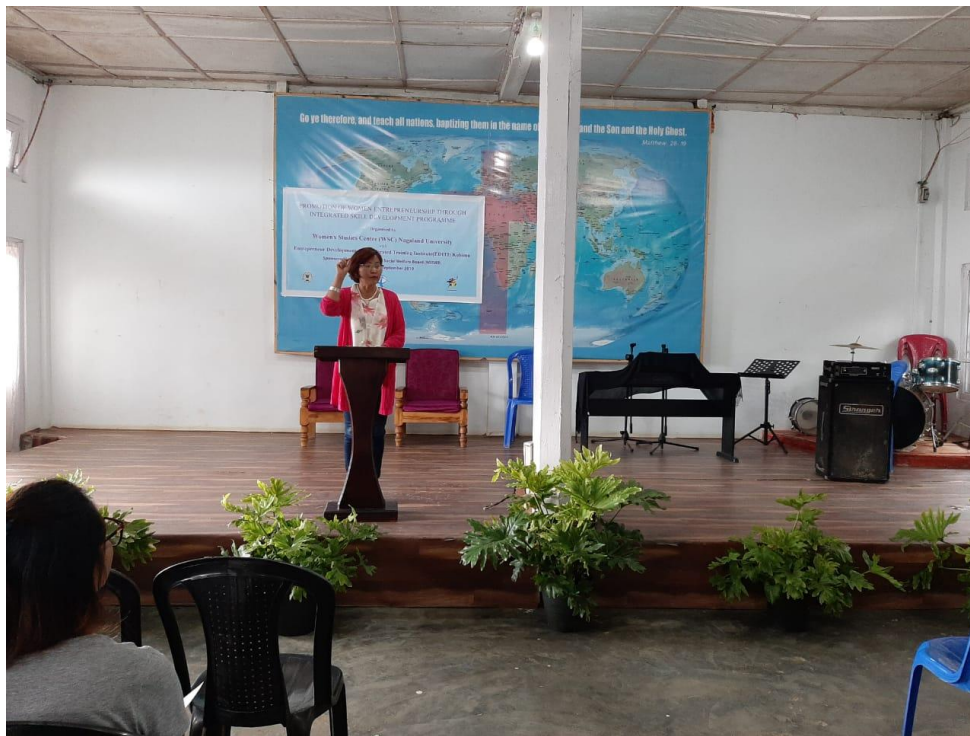
Managing Director, EDITI speaking in the inaugural program