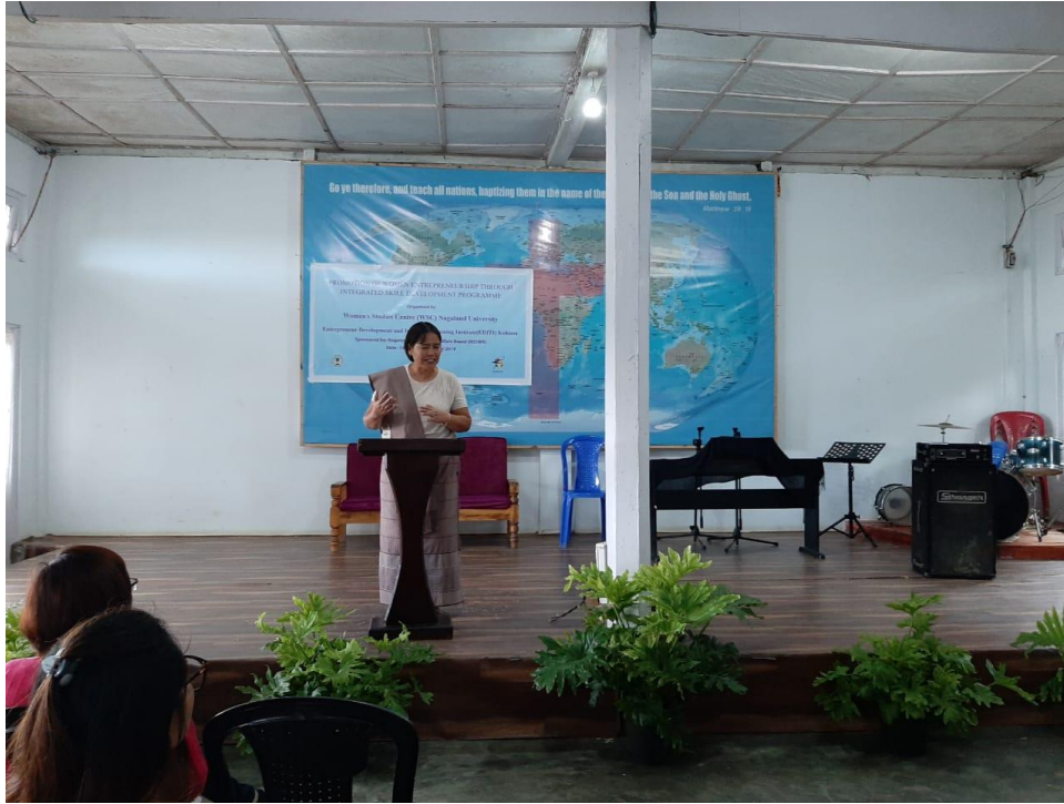
Director, WSC, NU speaking in the inaugural program